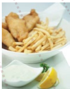
TRADITIONAL FISH AND CHIPS $88