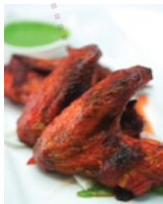
TANDOORI CHICKEN WINGS $98