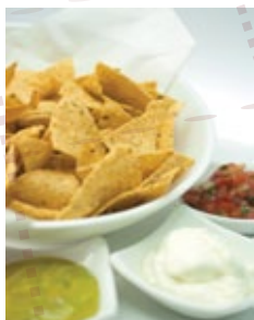
NACHOS-CORN TORTILLA $88

with Lime and Coriander Mayonnaise 炸蝦配青檸芫茜醬