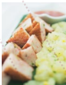
DEEP-FRIED CRAB CAKES $88