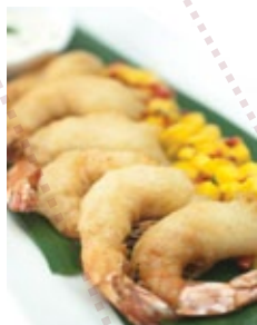
CRISPY FRIED CAJUN BATTERED PRAWNS $88

with Lime and Coriander Mayonnaise 炸蝦配青檸芫茜醬