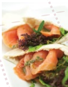
SEARED NORWEGIAN SALMON $98

with Tomato Salsa, Sour Cream and Guacamole Dressing 墨西哥粟米片配蕃茄沙沙、酸忌廉 及牛油果醬