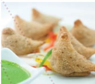
HOMEMADE INDIAN VEGETARIAN SAMOSA $88